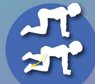
20 side leg extensions