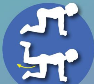
20 leg extensions