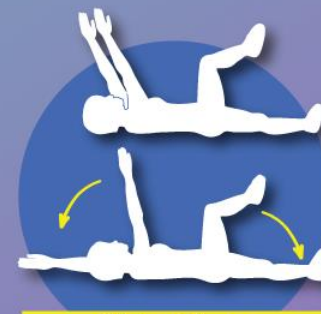
10 dead bugs