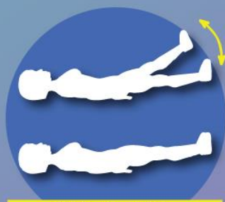
20 flutter kicks