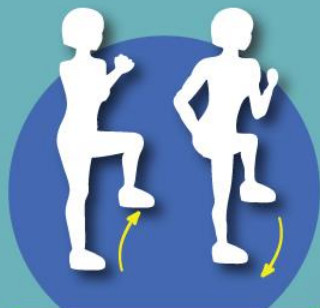
20 march steps

(1 min de descanso entre séries) NÍVEL I: 3 séries / NÍVEL II: 5 séries PLANO DE TREINO