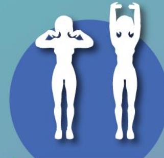
40 shoulder raps